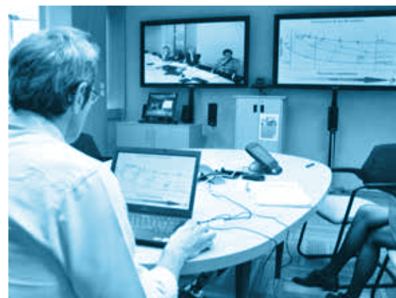
Recording a live training session in Pau, France.

Moreover, as many experts are reaching retirement, there is a risk of losing their knowledge and know-how. In this context, Total seek out to implement a recording solution in order to capitalise on the knowledge of its collaborators.